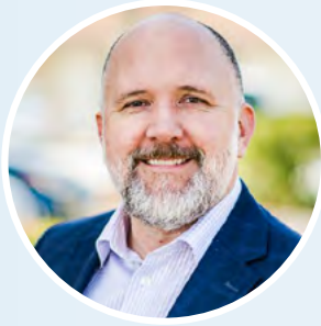
Hilton Swing Chairperson